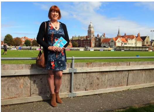
Eastbourne Town is a very welcoming club

In the real world of our daily lives we do at least have a bit more influence. As some of you may know, Sibyls became my pathway into the LGBTQI+ Christian world nearly 6 years ago now, and since then I've been able to flourish in different ways. Life at home has its challenges but so far we've managed to blunder on without too much conflict and I'm mindful of not abusing my very privileged marriage. In that time I've found other inclusive groups and churches, as well as broadening my outlook with a lot of football: I seem to be becoming a bit of a recognisable 'celebrity' around some of the grounds in the South East!