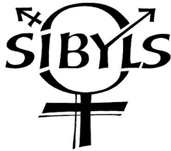
SIBYLS LOGO - ROBYN GOLDEN - HANV 28 MAY 2018