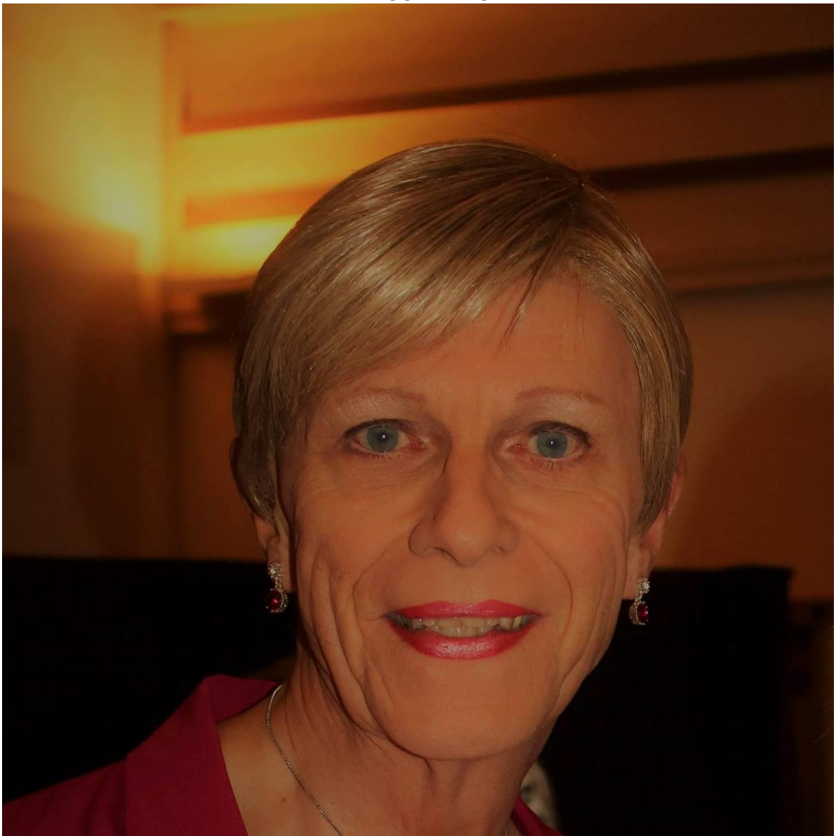
Hope in a Desert Place" (Part 3) – "Flying High" by Elaine Sommers

I am a bit of a birdwatcher, although you won't find me hiding in the bushes with binoculars and a notebook. No, I just love watching birds, especially when they're in flight. The ones which I enjoy most are those which soar. I've marvelled at red kites in the Wye Valley, eagles in the Scottish Highlands and lammergeiers in Nepal.